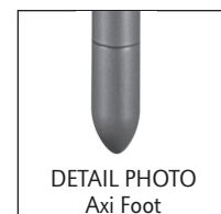
DETAIL PHOTO Axi Foot