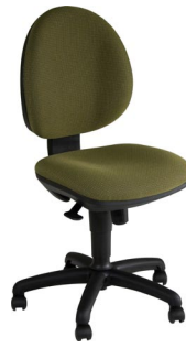
MANAGERIAL SWIVEL CHAIR