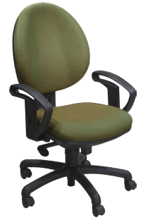
MANAGERIAL CHAIR W/ ADJUSTABLE ARMS