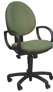
MANAGERIAL CHAIR WITH LOOP ARMS