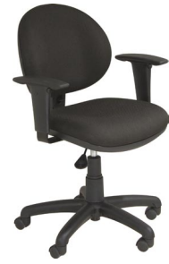
MEDIUM SWIVEL W/ ADJ. ARMS