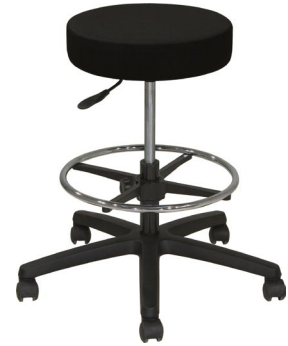
UPHOLSTERED STOOL WITH HIGH CHAIR KIT