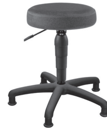
STOOL WITH OPTIONAL GLIDES