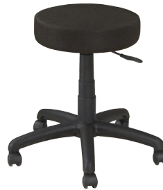
UPHOLSTERED SWIVEL STOOL