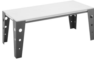
Steel & Laminate Top