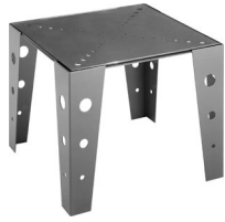
Steel & Glass Top