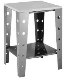
Steel & Laminate Top