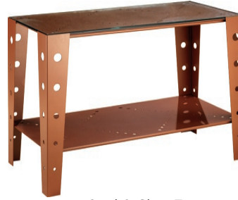
Steel & Glass Top