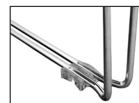
Detail: Santo Glides. Also serves as Ganging Device