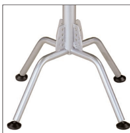
Optional Fin Design 4 metal sections designed with holes and welded to column and bottom plate.